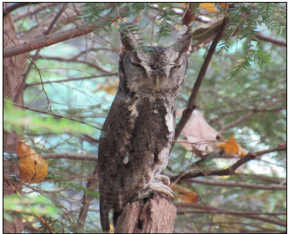
A camouflaged owl sleeping in Pa.