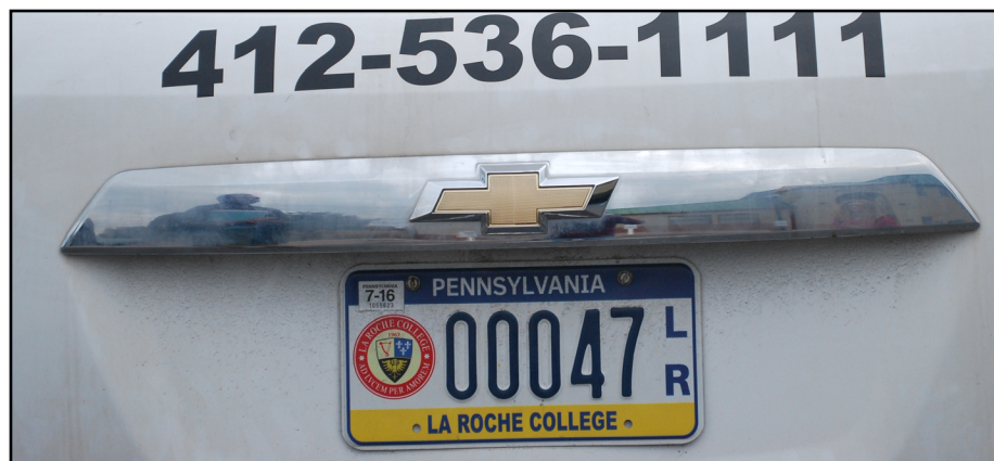
The Public Safety vehicle bears a La Roche College license plate.