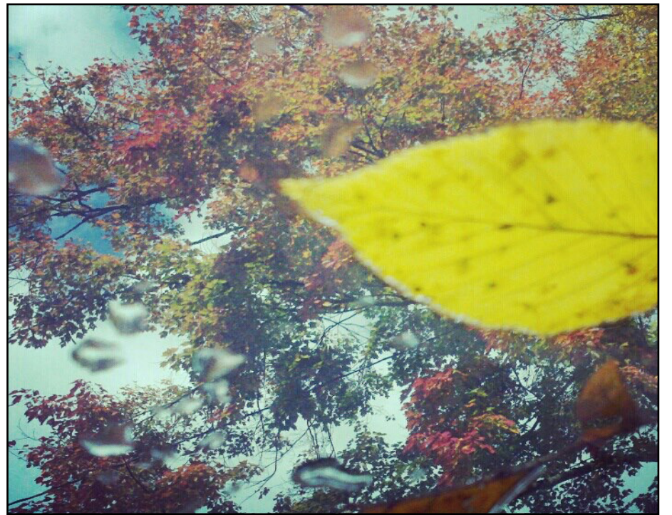
A kaleidoscope of colors and leaves after a rainy day.