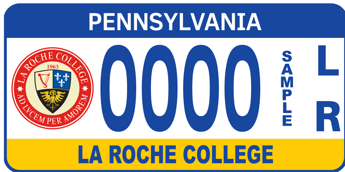
A sample license plate, which can be seen on La Roche's website.