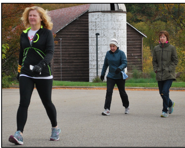
Participants bundled up in preparation for temperatures in the low 40s and cloudy skies.

He added that the idea behind the 5K was to show alumni that were on the cross country team that the program is growing but still needs their support.