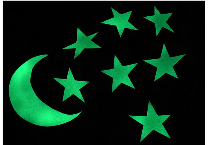
Ceiling stars, above, must undergo a complex chemical process before they can glow.

However, Dr. Bozym said, they are not often as bright or as strong as the colors we see in glow sticks.