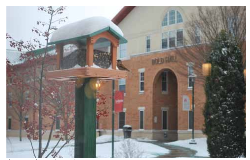
© SARAH REICHLE The view from the Father Peter Horton Lounge.

The outdoors offers countless memory-making opportunities during all four seasons. Even though the weather may be cold, you can still take advantage of outdoor winter time activities. Start a sled riding or winter trip tradition of your own to avoid catching an unwanted case of cabin fever.