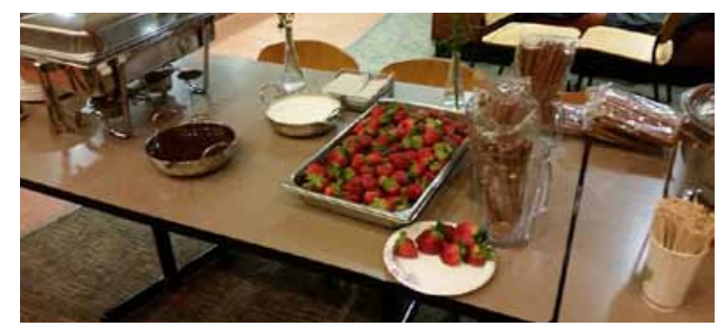
Desserts were provided for the dates.

As a whole, the date auction was a great way to put yourself out to the student body and meet new people. I met a lot of cool people and was glad to help a great cause, and help make awareness.