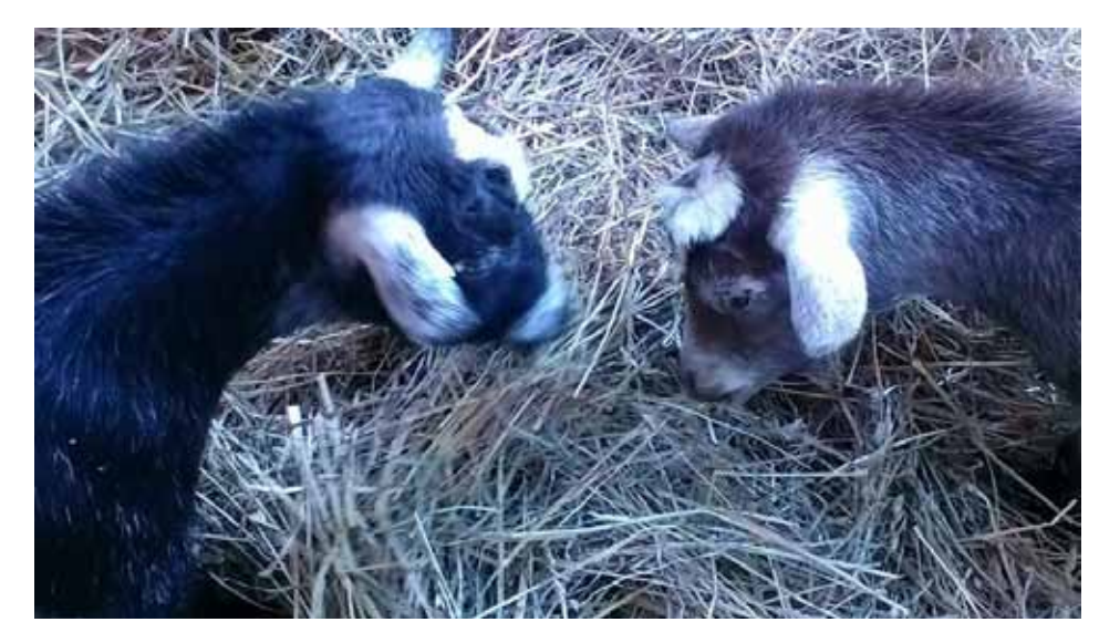
Two goats from the petting zoo.

Ranked as one of the "America's Scariest Halloween Attractions," The Scarehouse is sure to give you a fright with its three sections of