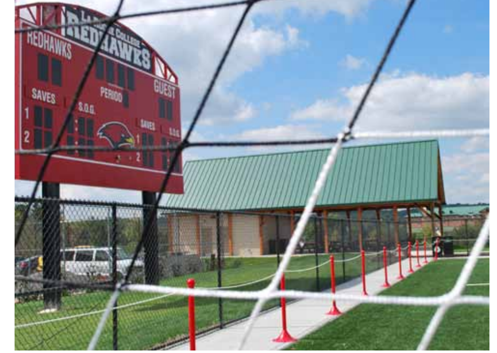
New scoreboard and pavilion.