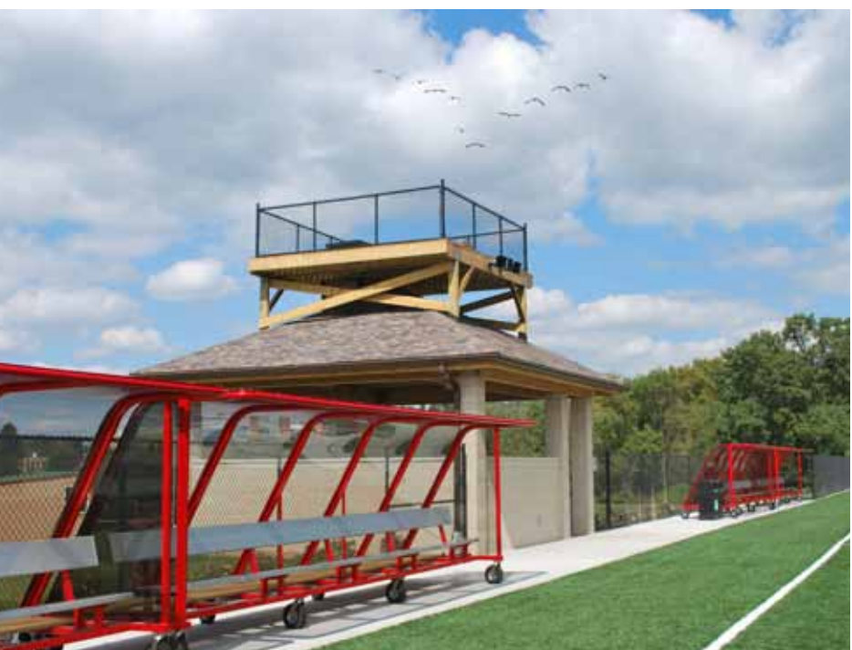
New bleachers and press box.