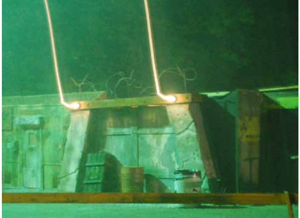
Hundred Acres Manor's new Zombie Paintball arena.