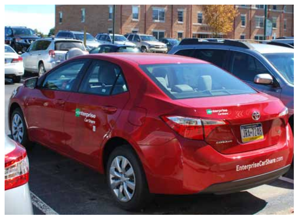
Enterprise car parked in the faculty parking lot