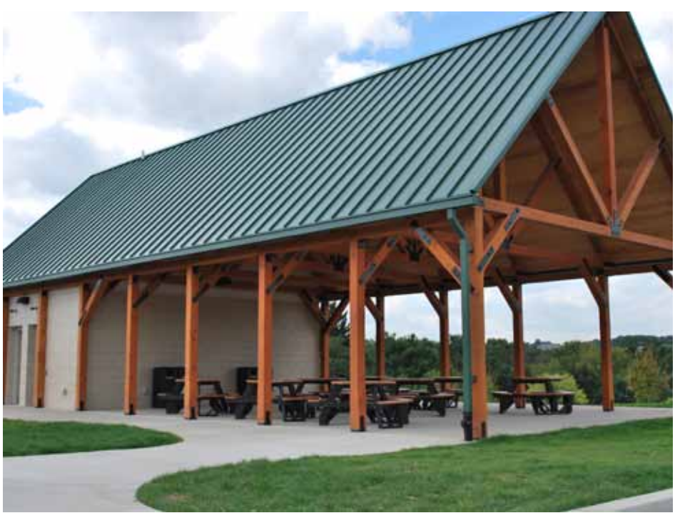
The new pavilion with attached restrooms.